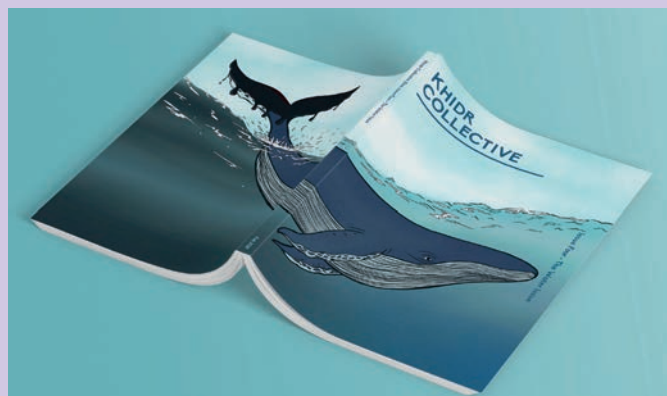
▲ Cover image from Issue Four: Water by artist Aman Aheer

"The Khidr Collective Zine, Issue Four: Water has been our fastest-selling zine to date due to the quality we were able to offer thanks to the generous funding of The Fenton Arts Trust. Without it, we wouldn't have been able to pay the contributors a fair rate and show them just how valued their work really is. During this difficult time of the pandemic, in which many sectors have suffered, this project was able to redistribute funds to creatives and provide something tangible, meaningful and reflective for the community. The funding also meant we were able to pay a small independent printer fair market rates."