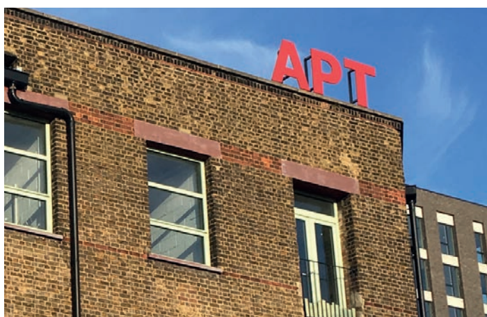
▲ Art in Perpetuity Trust building, Deptford, London

"We at APT are delighted to have been awarded funding from The Fenton Arts Trust to continue our mentoring programme for the next two years. We're particularly pleased as the current two mentees are having such a productive and rewarding time in their studios here, and we in turn are benefiting from their presence. It is such a positive award for emerging artists, during what must be a very challenging time for so many."