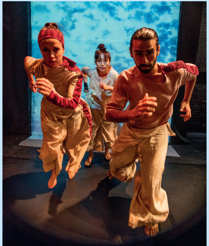
▲ Scene from Moonlight (Chi'isi)

"The money awarded from The Fenton Arts Trust was incredibly helpful and enabled me to explore 2D video graphics showing footage of Mapuche tribal lands, animation and motion graphics which was used at The Arcola. The money was used to create an original sound-score for the piece which will be adapted to match changes in creative technology. It was also used to create original artwork which I look forward to creating into posters and media. None of the above would have been possible without your funding, and I and the rest of the team are hugely grateful for this support. Moreover, the support has helped give longevity and a future to the work and I look forward to sharing this with you all!"