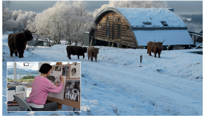
▲ Cove Park in winter, and resident artist at work

"The Early Career programme has supported 11 artists over three years and made an enormous difference to their work. The residencies have enriched our annual programme considerably, introducing Cove Park to some wonderful artists and allowing us to extend our support of early career artists to those specialising in music and composition. On behalf of everyone I would like to thank The Fenton Arts Trust for their very generous support of our programme over three years."