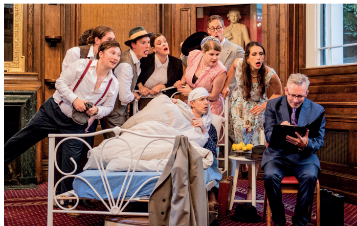
▲ Scene from Gianni Schicchi

"In 2018, Lunchbreak Opera had managed two productions – both by the skin of our teeth! We had hopes and plans for bigger and better productions, but we needed a vote of confidence from a funder to make them happen. The Fenton Arts Trust's grant helped us upgrade everything we did, from developing our organisation to improving marketing, designing better sets, and finally, to paying our singers properly. After staging Puccini's Gianni Schicchi in 2019 and A Dinner Engagement by Lennox Berkeley in early 2020, we feel we're in a far better place to plan for the future."