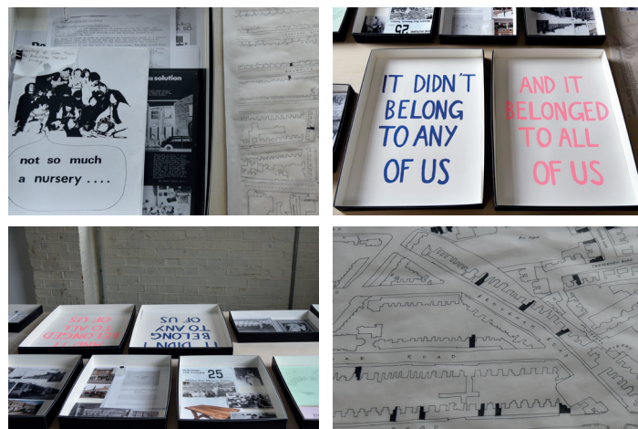
▲ Clockwise, from top left: