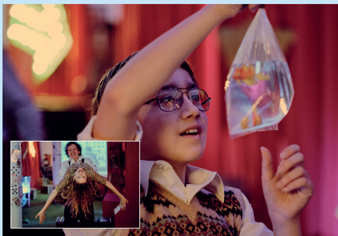
▲ Scenes from Fairground Reminiscence

"The Fenton Arts Trust helped support the creation and North East tour of Fairground Reminiscence. Over 2019 and 2020 the project visited art gallery spaces and a number of more unconventional performance venues such as community centres, festivals and a working men's club. We reached over 11,000 live audience members of all ages and continued to establish our work as professional artists within the dance sector. Through the Trust's support I have been able to develop and establish strong foundations as a dance maker. I hope to continue to make experiences that are meaningful, exciting and fun for audiences."