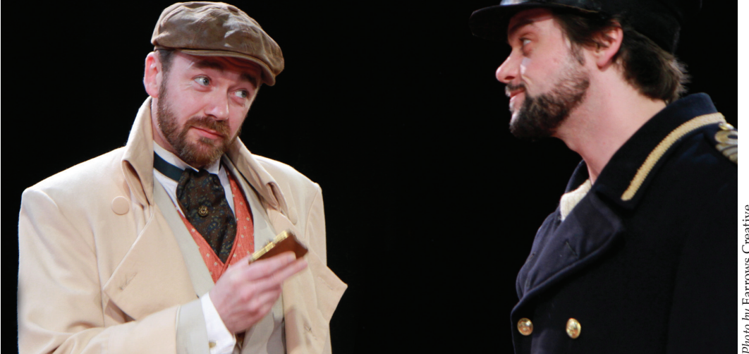
The Trust was pleased to support the graduate and apprentice actor scheme

"The Apprentice and Graduate Actor scheme was introduced by SATTF in 2009 to support and nurture talented young people seeking full-time places at drama schools and those who have recently graduated. This unique opportunity, which offers rare experience of ensemble theatre, is only possible with generous assistance from The Fenton Arts Trust and other supporters."